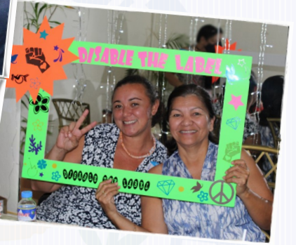
2021 VOICES/Self ADVOCATES TRAINING - ROTA