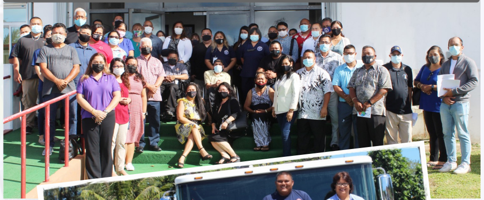
March 2, 2021 - DEVELOPMENTAL DISABILITIES AWARENESS MONTH PROCLAMATION SIGNING

The CNMI CDD funds used primarily for two purposes: (1) planning and (2) implementation of innovative strategies to address the needs of CNMI residents with developmental disabilities.